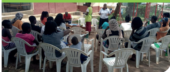
Namuli from the Village Health Team conducts an SRHR session during a saving group meeting

“Being able to meet at the facility on a weekly basis has enabled me to understand that there are services offered at the facility [other] than treatment. I am now able to refer my fellow peers to the facility to access services and to attend dialogues and health education”