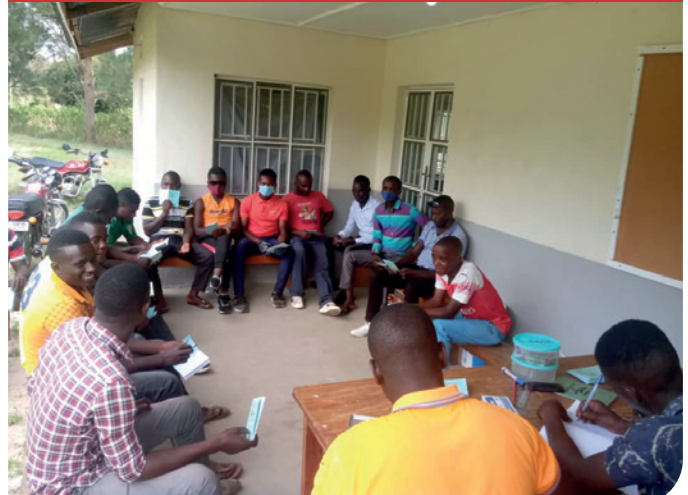
Boda boda riders from Kamwenge gathering for a saving meeting

“I know something on how to take care of my sexual life in addition to savings now” said a group member in Kamwenge.